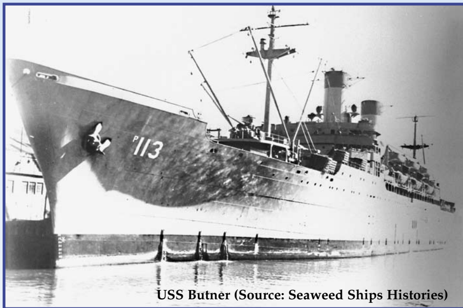
USS Butner

The USS Butner with over 20,000 troops aboard sailed slowly up the east coast of Leyte in the Philippine Islands until sundown. Existing in a world of top secrecy, no information had trickled down to me since sailing under the Golden Gate Bridge in January 1945. It had been two and a half months since any of us had a shower. This was before air conditioning. Below the Deck, on the USS Butner, the av-