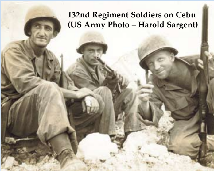
132nd Regiment Soldiers on Cebu

poncho stretched between four sticks they had found in the rubble. That device provided some shade from the relentless sun. Needless to say, I was welcomed heartily. In my brief journey, I had not seen one other person.